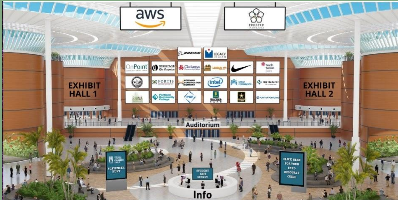
Image from 2021 Expo.

Students enter the lobby, then head off to explore.