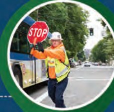
TRAFFIC CONTROLLER/ FLAGGER