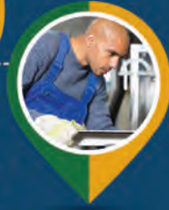
Sheet Metal Worker