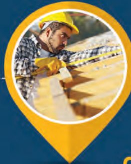
JOURNEY LEVEL CRAFT WORKER